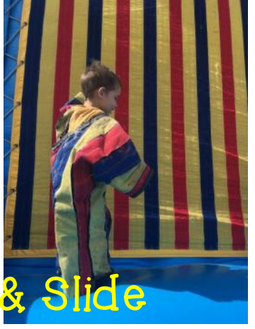
Sticky Wall & Slide